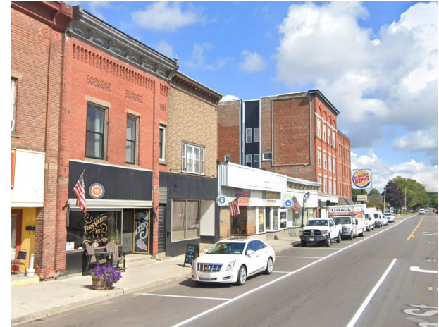
23-25 E. Main St.